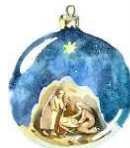
DIOCESE OF BROKEN BAY

Continue to gaze upon the Christmas creche, noting the images and themes that speak to our hearts: childlike wonder, joy, poverty, fragility, family, trust... and the nearness of God's presence. Writes Pope Francis, "To our astonishment, we see God acting exactly like we do: he sleeps, takes milk from his mother, cries and plays like every other child! As always, God baffles us. He is unpredictable, constantly doing what we least expect. The nativity scene shows God as he came into our world, but it also makes us reflect on how our life is part of God's own life."